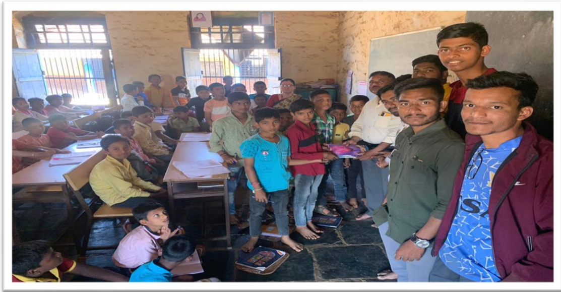
NSS Volunteers in primary school with children's during Notebook distribution