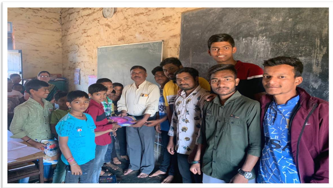
Notebook distribution to school to children